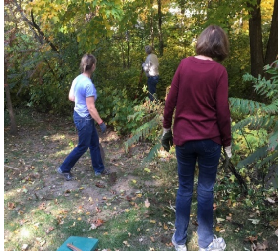
Recent 2022 Greenway Volunteers Work Day